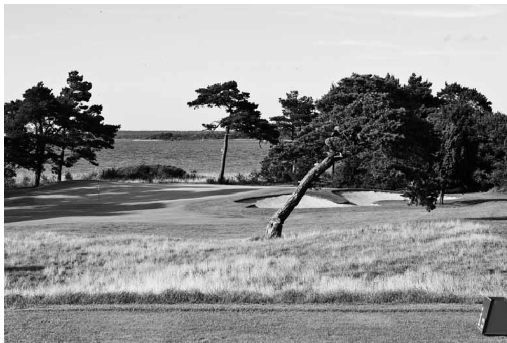
Players at the Kronholmen course face the sea on the first tee.

Svenska Hickorykannan is open for ladies and seniors who played in the championships on Saturday and for gentlemen who did not make the cut. Those who have not competed in the championships are also welcome. Handicaps are multiplied by 1.5.